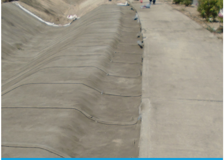
CCH pegged within anchor trenche