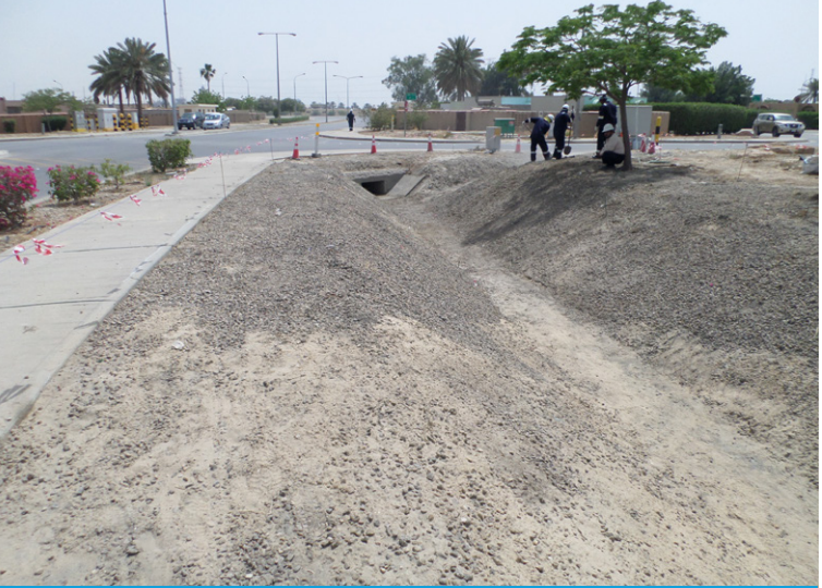
Following profiling and grading of the channel