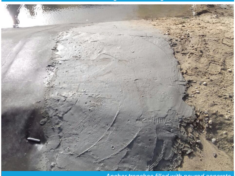
Anchor trenches filled with poured c