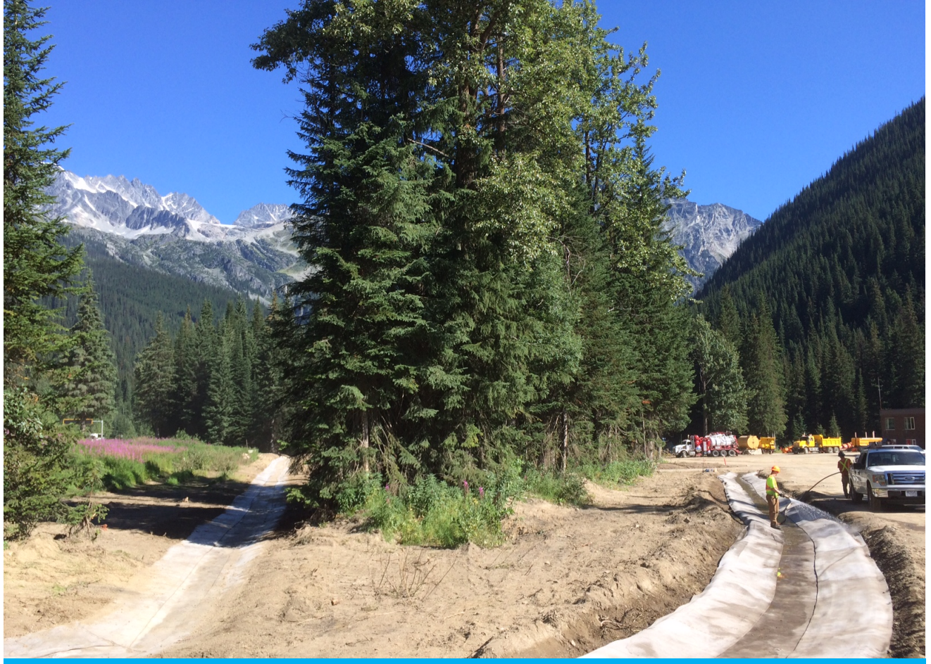
Completed top and lower ditches side by side