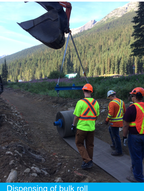
Dispensing of bulk roll