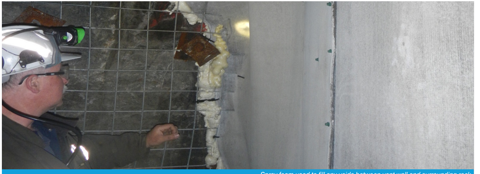
Spray foam used to fill any voids between vent wall and surrounding rock