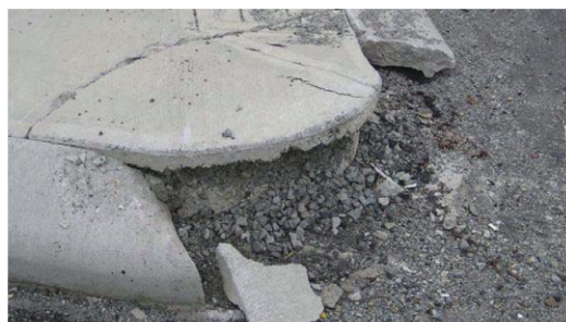
Close-up of damaged curb

*Geosynthetic Cementitious Composite Mat