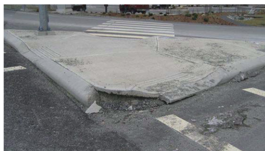
Damaged curb section at main junction

Following the success of the trial, which was completed in under two hours, a number of other curb sites are being considered for refurbishment using CC.